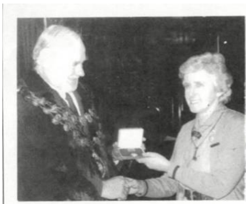
1987 Hawthorn Civic Award