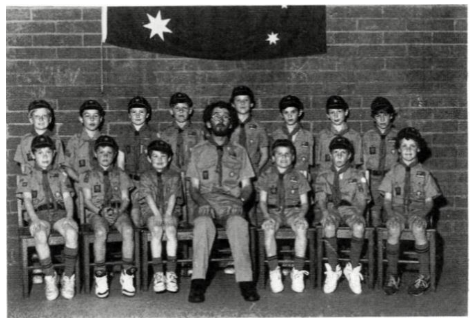
Cub Scout Pack 1992