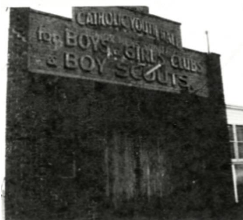
12 th Hawthorn Scout Hall