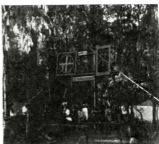
12 th Hawthorn Campsite Gateway – Giltoell Park, Easter 1966.

Below: Scout and Cub activities – "Campsite Gateway" 1966, "Puffing Billy" 1962, "World Jamboree in USA 1960"